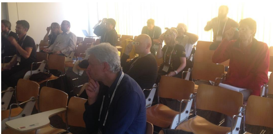
Figure 8: Audience of the demonstration session watching an anaglyph video.

A short summary of the discussion is provided in Table 2 below.